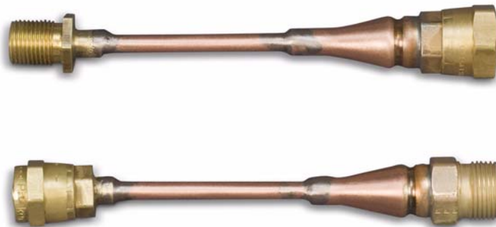
New Quick-Connect Adapter Kit (P/N: 755570000)

Self-sealing Quick-Connect Adapter Kits (P/N 755570000) are available for replacement cooling units or evaporators that join older "one-shot" units to their new self-sealing counterparts. (Professional installation is required to capture and recharge the refrigerant.)